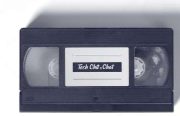
Tech chit chat podcast